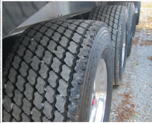
Optional Super Singles

to suit your personal preference and application