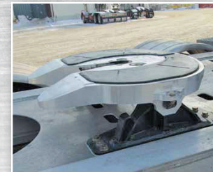
Standard Aluminum Fifth Wheel with Aluminum Lead Frame