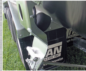
Standard Exterior Light Package