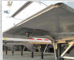
Standard Aluminum Coupler