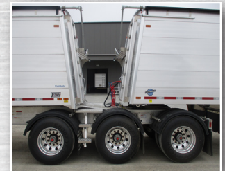
Optional Black Minimizer or Stainless Fenders