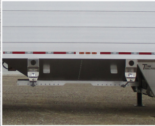
Standard Dual Cranks with Knock Rails 26" Clearance Hoppers

to suit your personal preference and application