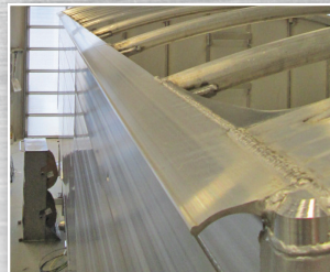
Standard Integrated Tarp Latch Plate