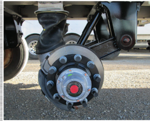
Optional Disc or Drum Brakes