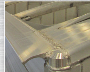
Integrated Tarp Latch Plate