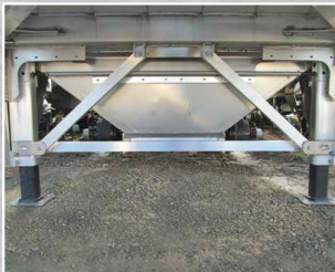
Jost All Aluminum Landing Gear