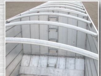
Arched Top Cross Members & Vented Divider Walls