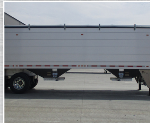
High Ground Clearance Hoppers (25")