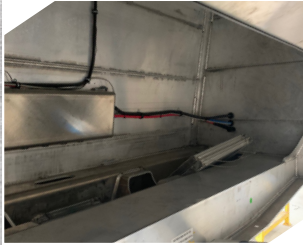
Storage above Coupler

to suit your personal preference and application