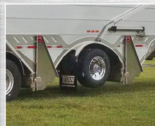
Dual Hopper Gates