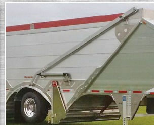
Air Operated, Spring Assisted Front to Back Tarp System