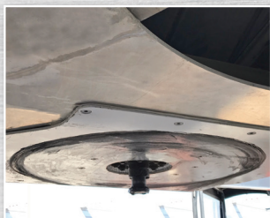
Aluminum Coupler Assembly with Bolt In Kingpin