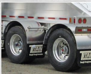
Smooth Fenders with High Clearance Pipe Brackets