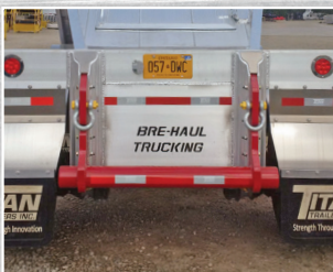
Aluminum Push Bumper with Steel Inserts, C/W Tow Shackles