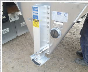
Aluminum Landing Gear, Drop Leg Style