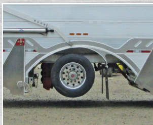
High Lift Titan ParaMAX Steer Suspension