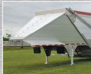
Aluminum Neck Fenders