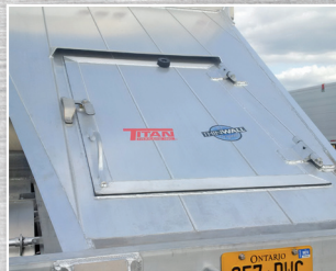
Rear Enclosure with Access to Air Tanks and Valving