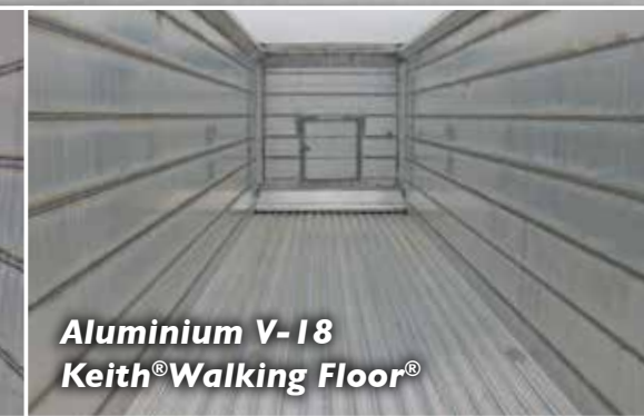
Aluminium V-18 Keith® Walking Floor®