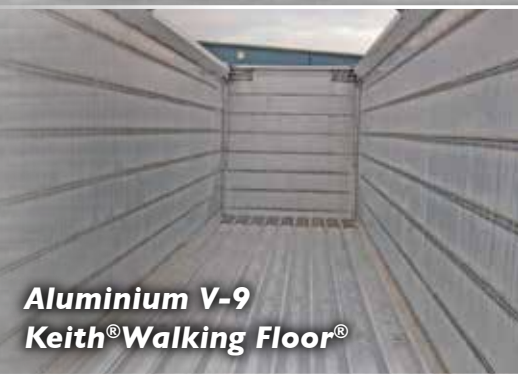
Aluminium V-9 Keith® Walking Floor®

Self locking, top hinged, over slung hydraulic doors.