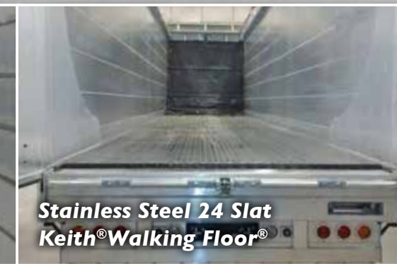
Stainless Steel 24 Slat Keith® Walking Floor®