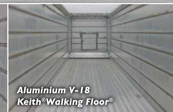
Aluminium V-18 Keith® Walking Floor®