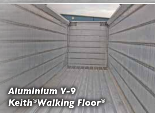
Aluminium V-9 Keith® Walking Floor®

Self locking, top hinged, over slung hydraulic doors.