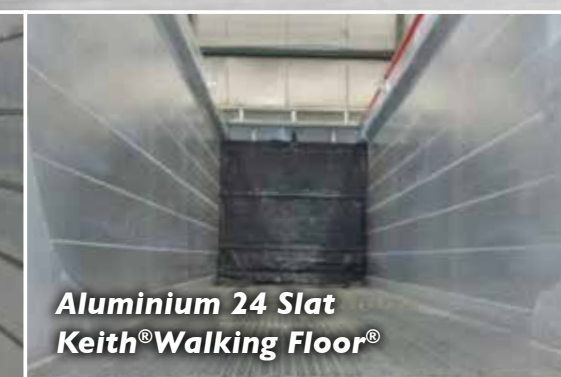
Aluminium 24 Slat Keith® Walking Floor®