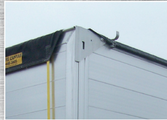
Extreme Overslung Hinge