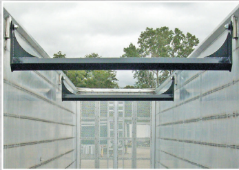
Drop Swing Bars for Top Crossmembers