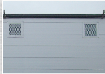
Air Vents on the sides