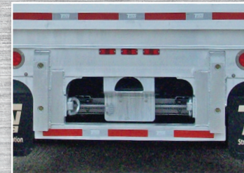
4x4 Solid Aluminum Bumper Blocks