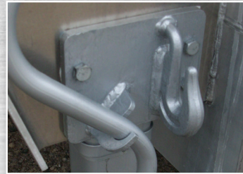
Safety Hook at Landing Gear