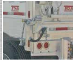
Air Release Latches for Tailgate