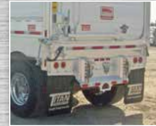
Aluminum Push Bumper with Aluminum Inserts with Tow Shackles