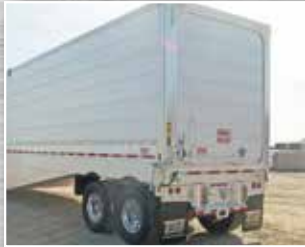
Top Hinged Overslung Door with Inner Air Flow

to suit your personal preference and application