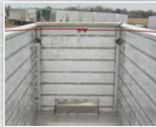
Spring Bar Top Cross Member