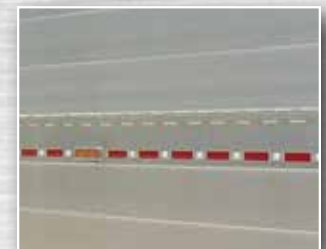
Tarp Bar Extrusion Full Length, Both Sides