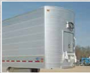
Eclipse Front with Man Door