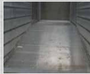
Sheet Channel floor