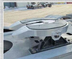
Aluminum Fifth Wheel with Aluminum Lead Frame