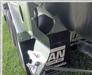
Exterior Light Package