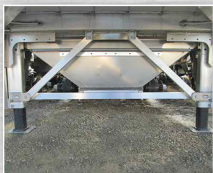
Jost All Aluminum Landing Gear