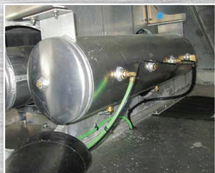
Aluminum Air Tanks