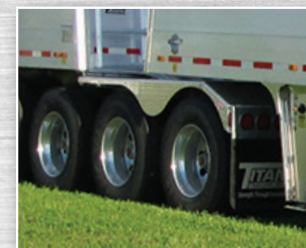
Titan Aluminum Contour Fenders