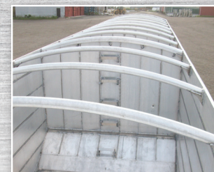
Arched Top Cross Members & Vented Divider Walls