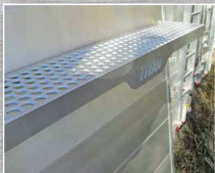
Front & Rear Catwalks

to suit your personal preference and application