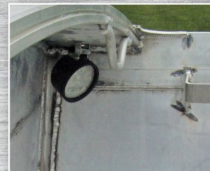
Interior Lighting Package