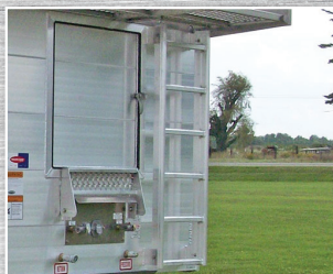
Front Roadside Ladder