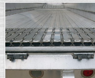
Keith® Walking Floor®