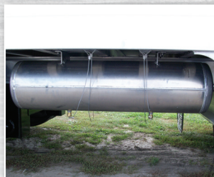
Aluminum Air Tanks