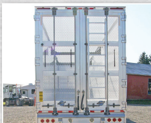
Mesh Rear Door