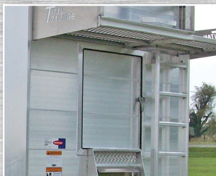
Front Access Door

to suit your personal preference and application