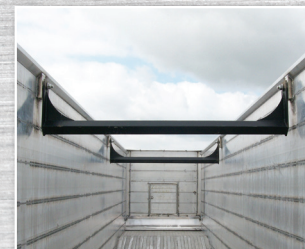
Top Cross Swing Bars