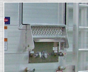
Flip Down Step