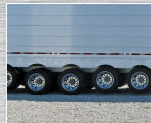
All Aluminum Chassis