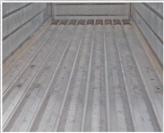
Keith® Walking Floor®