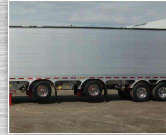
All Aluminum Chassis