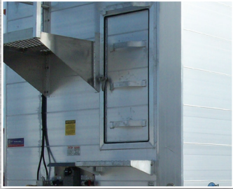
Front Access Door with Step

to suit your personal preference and application