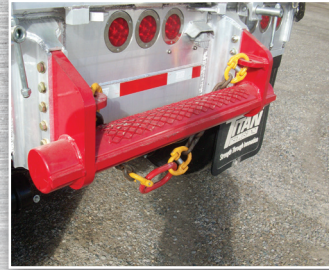
Aluminum, Offset, Push Bumper