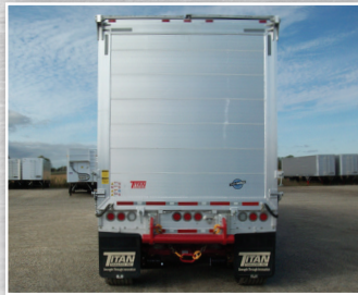
Backslung, Top Hinge, Solid, Air Release w/side Finger Locks