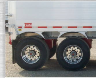
Fenders with Filler Strips