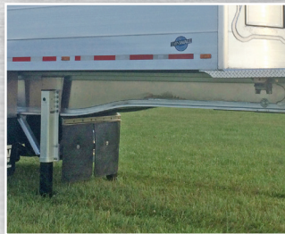
All Aluminum Chassis