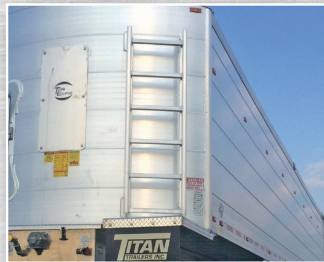
Roadside Access Ladder