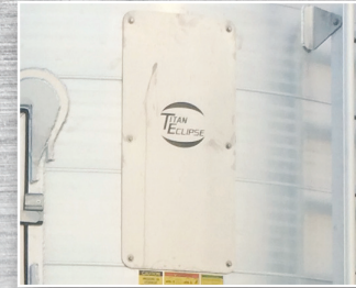
Hoist Access Plate