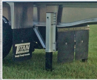
Aluminum Landing Gear