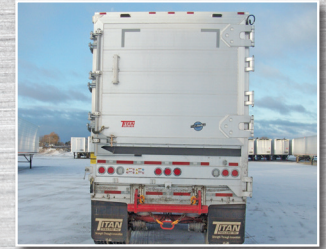
Side Swing Door with Manual Side Release