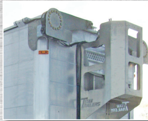
Hydraulic Operated Compactor roof