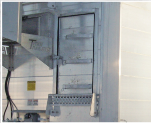
Front Access Door Mounted Roadside