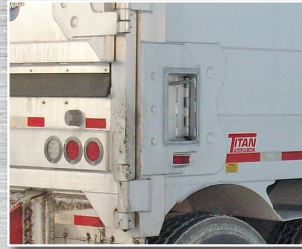
Side Grabs for Compactor