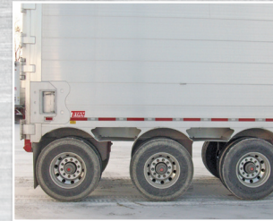
Fenders with Filler Strips