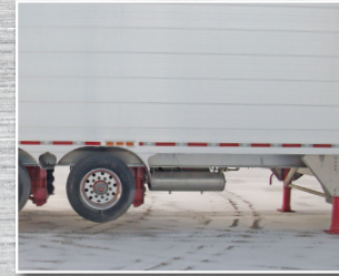
All Aluminum Chassis