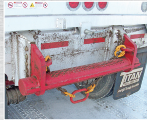
Aluminum Pusher Bumper with Steer Bumper Inserts C/W Tow Cable