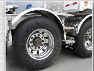
Standard Stainless Steel Fenders