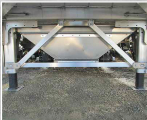
Standard Jost Aluminum Landing Gear