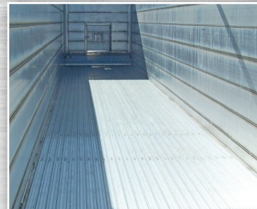
Keith® Walking Floor®