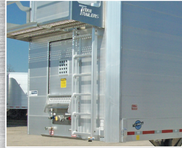
Front Ladder Driver Side