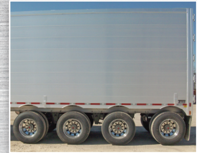
All Aluminum Chassis