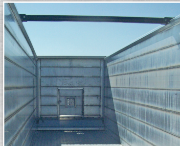
Single Top Crossbar