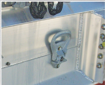
Fold Down Step