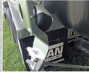
Exterior Light Package