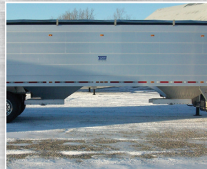
High Ground Clearance Hoppers