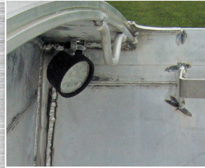
Interior Lighting Package