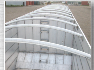
Arched Top Cross Members & Vented Divider Walls