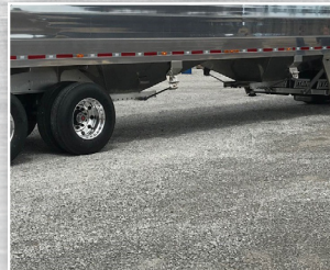
High Ground Clearance Hoppers (25")