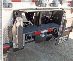
Steel Centre Pull Pin with Rubber Bumper T-Blocks Bumper