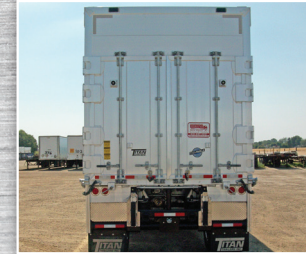
Outer Top Hinged with Inner Van Door Style Compactor Doors