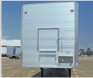
Front Access Door with Flip Down Step

to suit your personal preference and application