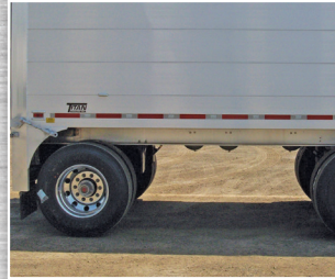
All Aluminum Chassis