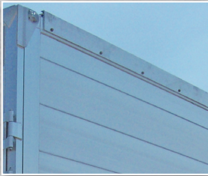
Bolt on Compactor Roof