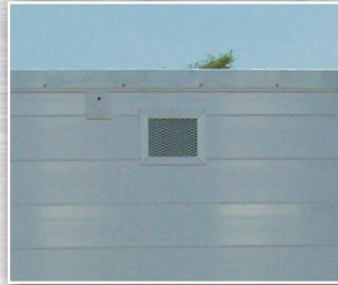
Vents in Sidewall