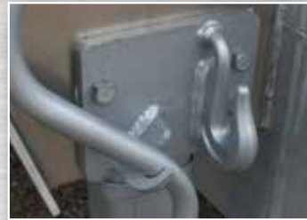
Safety Hook at Landing Gear