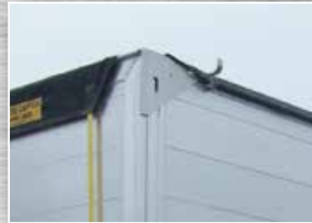
Extreme Overslung Hinge