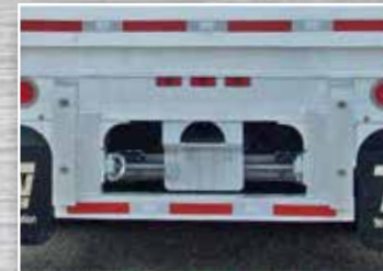
4x4 Solid Aluminum Bumper Blocks