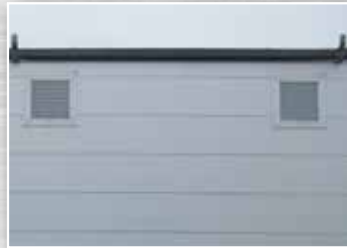
Air Vents on the sides