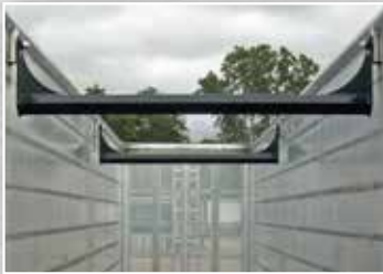
Drop Swing Bars for Top Crossmembers