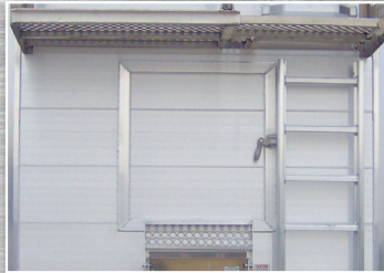
Front Man Door