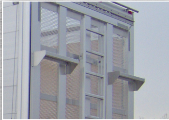
Mesh Rear Door

to suit your personal preference and application