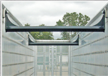
Drop Swing Bars for Top Crossmembers