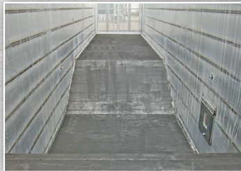
Graphite Applied to the Floor