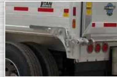
Adjustable Manual Release