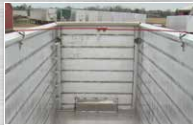
Spring Bar Top Cross Member