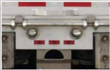
Back Up Lights