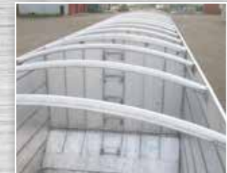
Arched Top Cross Members & Vented Divider Walls