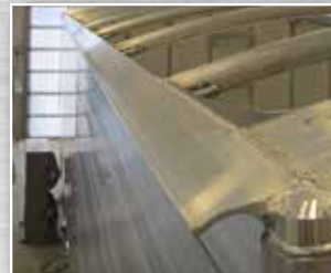
Integrated Tarp Latch Plate