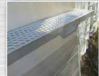
Front & Rear Catwalks