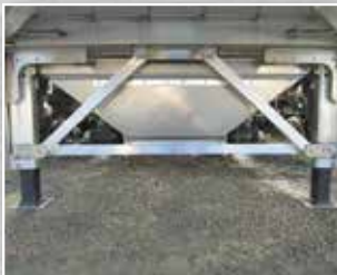
Jost All Aluminum Landing Gear