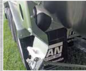
Exterior Light Package