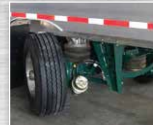
Titan ParaMAX with 10" Lift