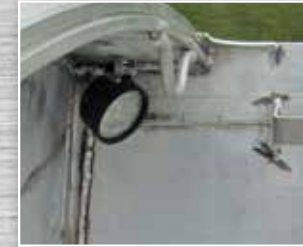
Interior Lighting Package