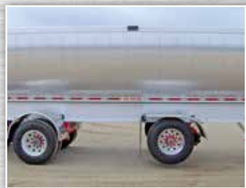
All Aluminum Chassis