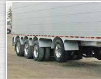
Fenders Over Primary and Steer