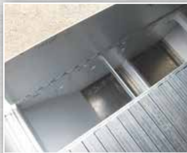
Internal Rear Hopper