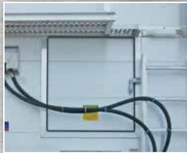
Front Man Door