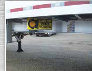
All Aluminum Chassis