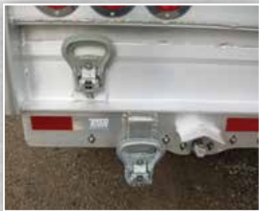
Fold Down Steps