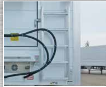
Front Ladder Driver Side