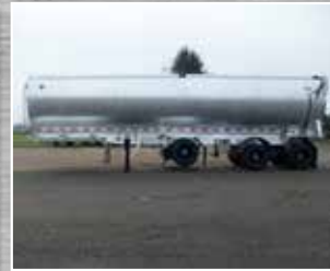
All Aluminum Chassis