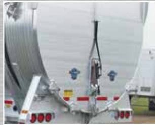
Hydraulic Operated Door Lock